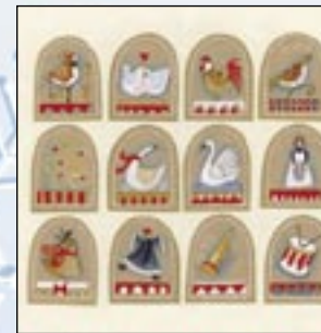
12 Days of Christmas £3.75