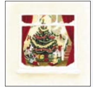
Christmas Morning £3.75