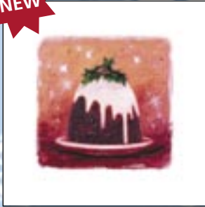
Figgy Pudding £3.25