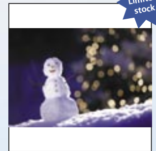
Frosty the Snowman £3.25