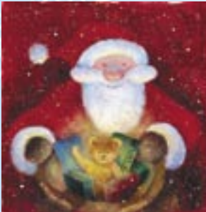
Father Christmas £3.25