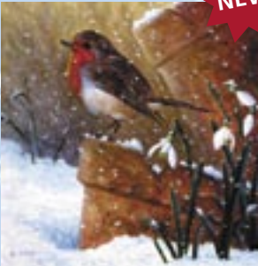
Robin amongst the Snowdrops £3.25