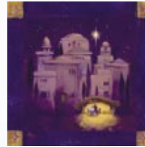
Holy City £3.75

Order before 16th October and postage and packaging is free!