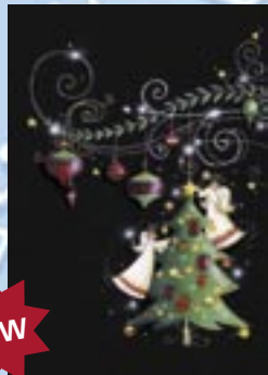
Stars for the Tree £3.50

Batten Disease is a rare genetic, neurodegenerative disorder affecting children and young adults. Batten Disease causes a progressive deterioration of the brain and nervous system, leading to an early death. There is no cure at present.