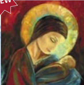
Holy Infant £3.75