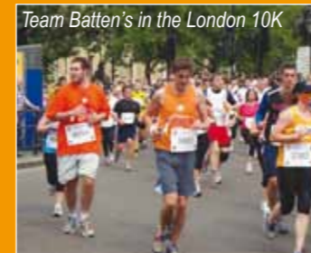
Team Batten's in the London 10K

This year's Sponsored Walk for Batten's will take place on Saturday 19th May at Cannock Chase, Staffordshire. It is a beautiful location and our volunteers have chosen some fantastic walking routes to enjoy. As a walker you can choose to walk either the morning 5 mile walk or the full day 9 mile walk. The morning walk is fully accessible for wheelchairs and pushchairs. The day doesn't have to stop with the walk. The BDFA will be staying at a local hotel where we will enjoy an evening meal together with a quiz – it's a great social event and a good way to become involved in the Batten's family. To receive your 2012 Sponsored Walk for Batten's pack just email your details to: fundraising@bdfa-uk.org.uk or download the pack from: www.bdfa-uk.org.uk/sponsorship . Why not encourage your work colleagues, friends and family to join in this great event and help to bring light to Batten's in 2012.