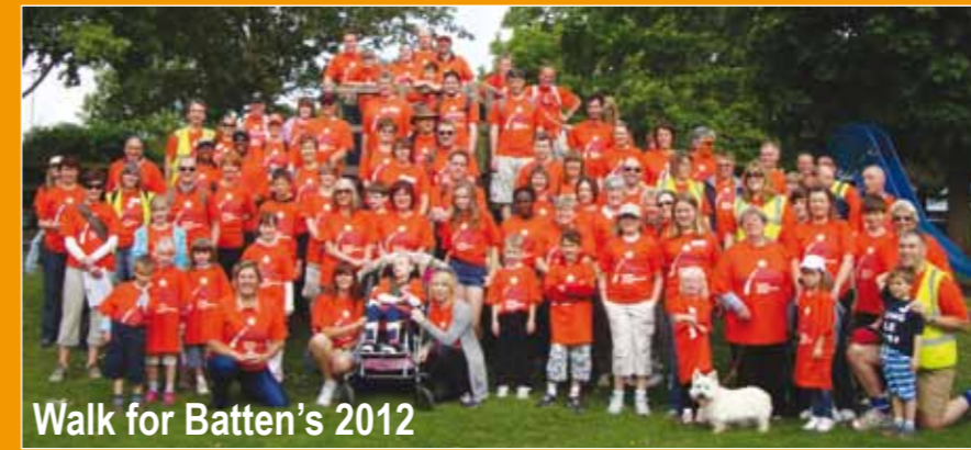
Walk for Batten's 2012

This year's Sponsored Walk for Batten's will take place on Saturday 19th May at Cannock Chase, Staffordshire. It is a beautiful location and our volunteers have chosen some fantastic walking routes to enjoy. As a walker you can choose to walk either the morning 5 mile walk or the full day 9 mile walk. The morning walk is fully accessible for wheelchairs and pushchairs. The day doesn't have to stop with the walk. The BDFA will be staying at a local hotel where we will enjoy an evening meal together with a quiz – it's a great social event and a good way to become involved in the Batten's family. To receive your 2012 Sponsored Walk for Batten's pack just email your details to: fundraising@bdfa-uk.org.uk or download the pack from: www.bdfa-uk.org.uk/sponsorship . Why not encourage your work colleagues, friends and family to join in this great event and help to bring light to Batten's in 2012.